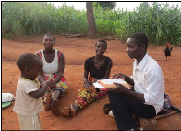
A COCD Facilitator Visiting a Household in the CHIEF Program

with the household but still monitors its transformation progress. Households receiving less contact time are replaced by new households.