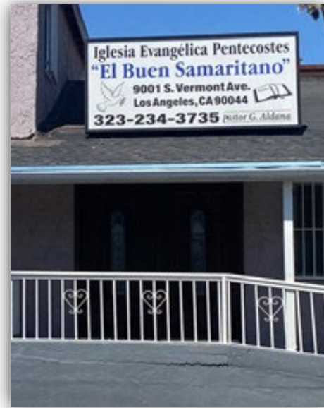
Figure 6 Dove on “El Buen Samaritano”

Furthermore, the dove appears in a very particular way on two other church buildings on Vermont Avenue. One church named “Do Right Christian Church” upholds two large painted doves on the front wall of its building directly facing each other (Figure 7).