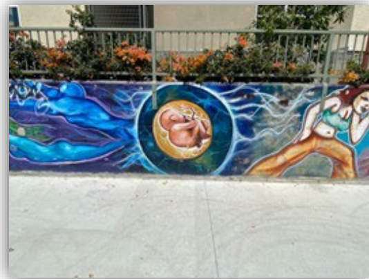
Figure 4 Embryo on Vermont and 88th, Los Angeles

The image of an embryo (Figure 4), immediately points to the beginning of life—the antithesis to death. Across this mural wrapped around the apartments, several themes of life emerged into the city streets.