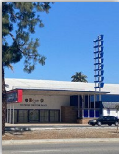
Figure 9 Southside Church

As one approaches the building more closely, one begins to see the religious dimensions more clearly. The building’s wall near the sidewalk is filled with many tiles that reflect a mosaic style. Four of them (Figures 10-13) contain symbols which connect them to the four gospels of the New Testament. The images become the gospel narrative spilled out into the streets. The symbol of the king, ox, man, and eagle are identified with the four gospels accordingly.