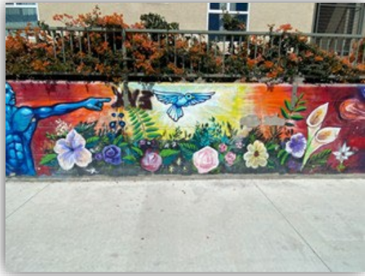
Figure 5 Blue Bird on Vermont and 88th

There was also an image of a blue bird (Figure 5), which relates to another specific religious symbol that reappeared on Vermont Avenue—the dove.