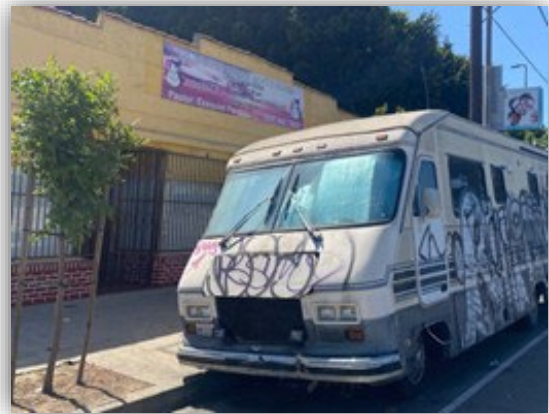
Figure 21 Iglesia Juan 3:16 and Schedule