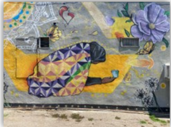
Figure 23 Bowing (praying?)

George Ferguson writes: “In the early days of Christian art, Christians hesitated to depict the countenance of their God, but the presence of the Almighty was frequently indicated by a hand issuing from a cloud that hid the awe-inspiring and glorious majesty of God, which ‘no man could behold and live’ (Exodus 33:20). The origin of this symbol rests in the frequent scriptural references to the hand and the arm of the Lord, symbols of His almighty power and will” (Ferguson 1966, 47). The hand, in this religious interpretation, as descending from a cloud contains supernatural references. Yet this painting still reflects the more human side of help and compassion, as seen in the hand's normal skin and features. The depiction of a hand reaching out to help, reminds us of religions' tendency on sidewalks to reach out and to be factors of life in urban communities. In these murals (Figures 22, 23), though religious interpretations can be made, they contain ideas of ordinary human acts as well. Helping on Vermont Ave. is spiritual, but it is also practical. It is not limited to the religious dimension, though religion has its role. The mural of the hand reaching for another hand (Figure 22) functions as a poetic sign to represent forms of religious and social life on Vermont Avenue. This act of help is realized in both the religious centers offering spiritual and practical help, and in community centers like the local YMCA supporting the needs of the youth. Here, communities