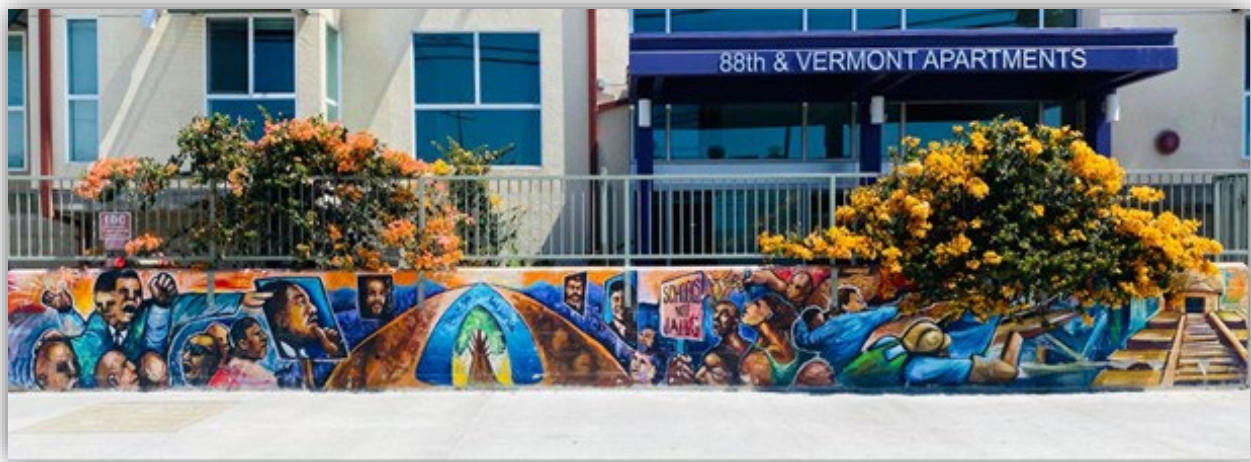
Figure 3 Mural Wall on Vermont and 88th

In relation to religion, in the center of this mural on social justice (Figure 3) is a tree and written over it are the words “Tree of Life” in English and Spanish, recalling the biblical story of the garden of Eden and the tree of life in the story in Genesis. With the roads leaning towards the tree in the middle, the theme of life seems to be at the center of this mural. The weaving of religion and social justice echo religion’s role and influence on social movements in general. In the same mural, as it stretches around the 88th & Vermont Apartments, the mural emphasizes further themes that express human life and forms of religious and spiritual life.