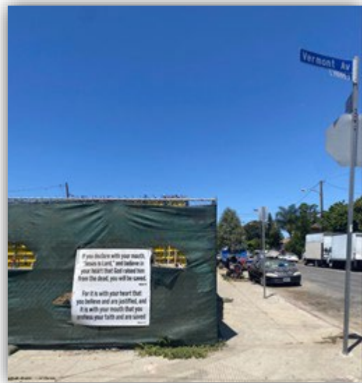
Figure 18 White Sign on Sidewalk

Perhaps some people would not be able to fully make the connection between the text and the symbols. Maybe some symbols, such as the ox, man, and eagle, would require more background knowledge than others (cross, bible, etc.). Thus, some of these symbols, like phatic signs, are perhaps only understood among a “shared [religious] culture,” which makes their meanings more accessible to those with more insider knowledge (Williams and Shortell 2021, 56). The biblical symbols can also function as reflexive signs, since some symbols are identifiable to outsiders while others are not. They may know these are religious symbols because of some level of exposure to them, but still may not pay too much attention to them.