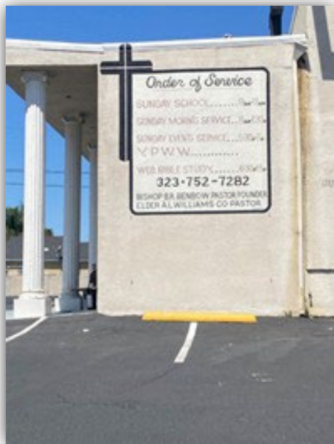
Figure 19 Order of Service

These signs function as invitations and as means of promotion, recalling the expressive sign since there are particular “motives” behind their usage (Williams and Shortell 2021, 55). The conative function is also at work for the times of these services on these various church buildings magnifies moments of concentration, both religiously and ethnically if one considers the aspect of language (Figures 20-21).