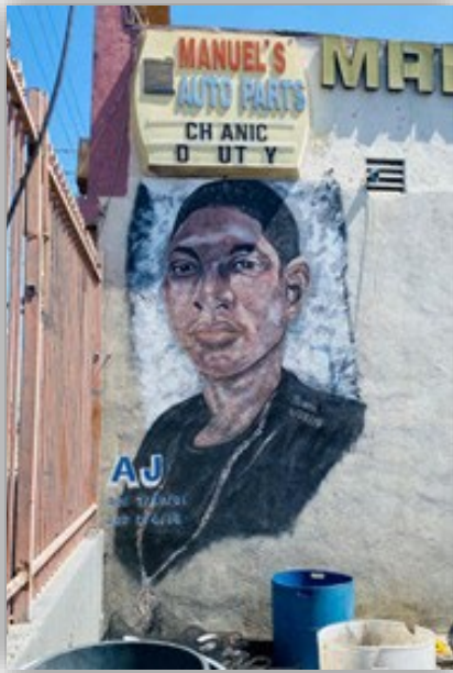
Figure 1 Mural of AJ, Los Angeles

Earlier on the street, before I reached this mural, I saw a small sign that read “Justice for AJ” (Figure 2) and wondered who this was referring to? A few blocks later,