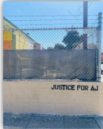
Figure 2 Justice for AJ

The poetic sign and other signs were seen on other mural paintings near the sidewalks of Vermont Avenue. There are religious implications in these other murals, particularly, themes of life that stand in direct contrast to death. In relation to identity, the mural below (Figure 3) contains a strong