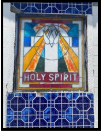
Figure 8 Tile of Dove

The second picture of the dove descending was actually from a church building (Southside Christian Palace Church) near the intersection of Vermont Avenue and Imperial. The building (Figure 9) embodies the referential sign due to the large logo that reads “SOUTHSIDE” running across the side of the building. Immediately, it stands out, yet it breaks away from the normal style of typical church buildings. The referential function causes the eye to focus on the building like cathedrals or other large religious structures normally do, yet there remains a distinction (Williams and Shortell 2021, 55).