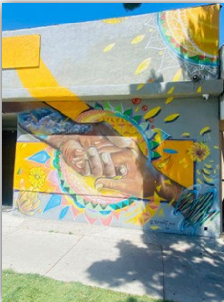
Figure 22 Mural of Two Hands Holding

Near this mural, on the side of the same building, an image with more religious connotations is painted. It captures a woman in the act of bowing, possibly praying, and holding a small cup (Figure 23). This woman's act expresses the reflexive function, since many know she is bowing or praying, but are not fully aware of all the religious dimensions operating. In the mural, located on the front of the building, the hand from above contains clouds on the wrist, and echoes religious symbolic interpretations.