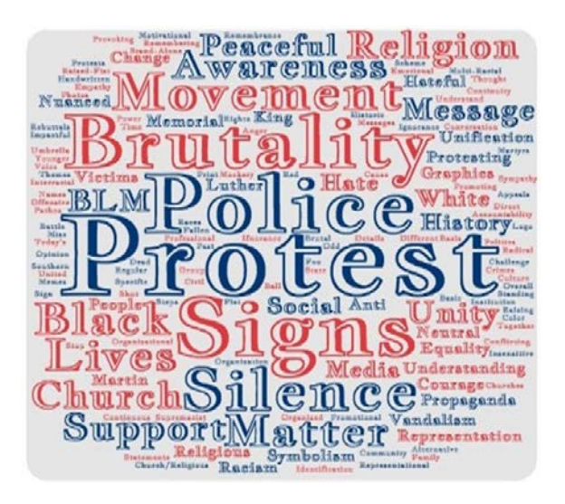
Figure 3: A word cloud of the words that were used most often in the participant's group discussions. The larger words may offer intersection points for contextualizing a message to participants.

movement" provided subsets for this category. Further analysis revealed how responses like, "strong hate shown toward the movement," "photos involving All Lives Matter," and "images that provoke a negative reaction due to supporting the injustice or speaking against the BLM movement" fit into the Opposition Against BLM theme. A generalized perspective of the pile themes was used to present the data in Figure 3. This Word Cloud can be used to gain a generalized perspective of terms and ideas that influenced participants' perspective about the BLM movement.