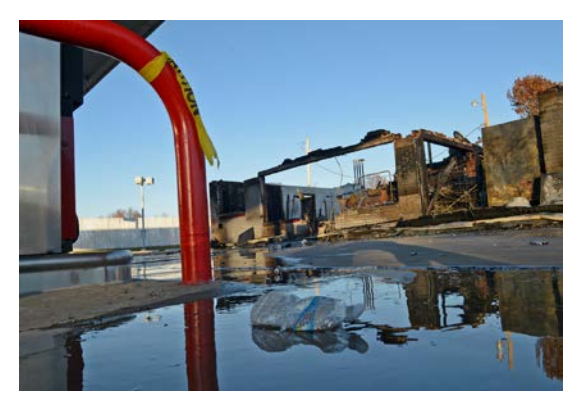
Figure 1: The remnants of a burned Conoco Phillips gas station in Ferguson, Missouri, November 25, 2014.