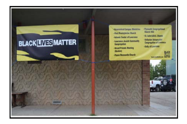
Figure 4: BLM banners hanging outside of the Ecumenical Campus Ministries building in Lawrence, Kansas. The banners feature the names of nine churches and one Islamic center equally.

Participants expressed how the two signs in one picture was a thoughtful act of ecumenical unity. For the participants, unity is represented with the coming together of different people, organizations, and causes for the greater good. Interestingly, there were no people present in the photograph that participants said was an example of unity. The participants read in the unity theme by what was printed.